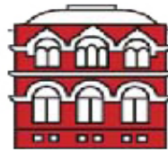
NATIONAL ACADEMY OF ARTS BULGARIA