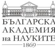
BULGARIAN ACADEMY OF SCIENCE